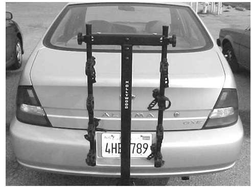
Fold arms down when not in use.

Special Fitting Note: In some situations, particularly with very small bikes, or bikes with creative frame designs (for example, "Y" and "V" frame bikes) it may be necessary to remove the lower anti-sway blocks. To do this, simply use a 5mm Allen wrench to remove the bolt that attaches the lower anti-sway block to the main (upper) bike cradle. The nut is captured by the anti-sway block, so you will not need to hold the nut.