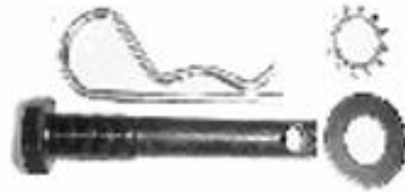
FIG. 2: Clockwise from upper left, hitch pin clip, star washer, flat washer and threaded hitch pin.