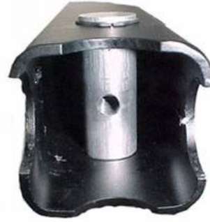
Fig. 4 Vertical Cylinder

Tools required: 2 adjustable wrenches or two \frac{3}{4} " wrenches (open, box or socket).