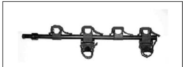
FIG. 6 Passenger's Side Support Arm