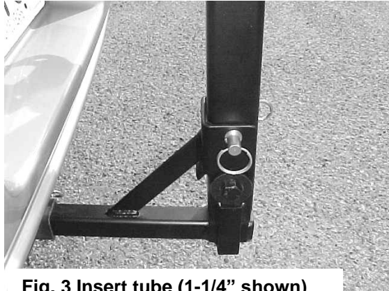
Fig. 3 Insert tube (1-1/4" shown)