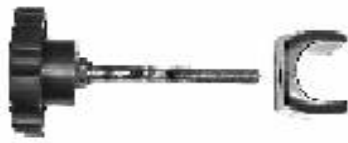
FIG. 1: Black Knob with threaded rod attached and pivoting spacer block.